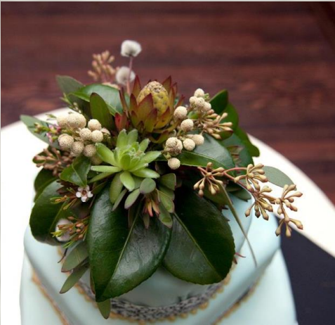
Table Centerpieces Start at $30. Most end up between $45 - $85.

(Archway) Swags Start at $95. Most end up between $150 – 300.